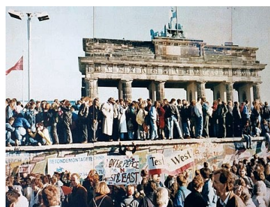
Germans stand on top of the Wall in front of Brandenburg Gate in November 1989 in the days before it was torn down